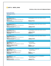
Employment Credit Report