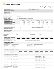
Banking Detail Report

Customers using this report also found these complementary products helpful: