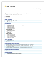
Trace Detail Report