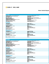
MVR Driver Records